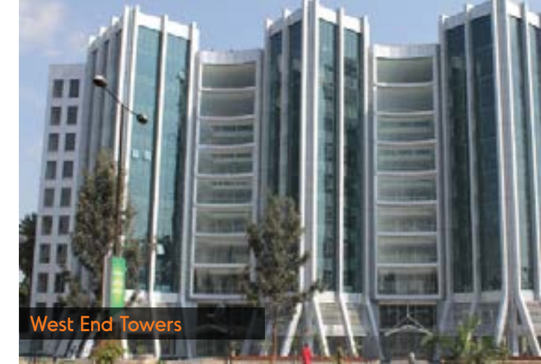
West End Towers